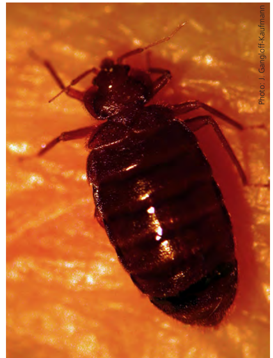
Well-fed bed bug engorged with blood.