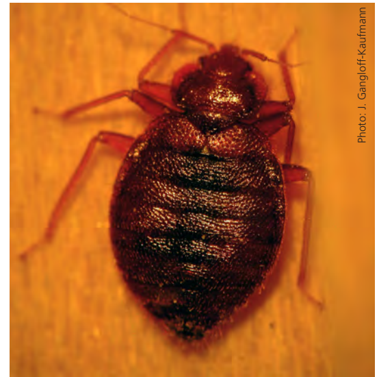
Adult bed bug.

Adult bed bugs are straw-colored to reddish-brown, oval bodied insects with undeveloped wings. Their upper bodies are covered with short, golden hairs. Before feeding, they're 1/4–3/8" long (about the size of a lentil) and nearly as flat as a piece of paper—which is why they can fit into such narrow crevices. Their appearance changes dramatically after they've fed; bed bugs become bloated and dark red and have been described as "walking blood drops." Their eggs are VISIBLE – white in color, bean-shaped and about 1/32" long, about the size of a grain of salt, with a "lid" at one end through which the young will emerge. Eggs are laid in crevices, scattered randomly or in small clusters.. Newly hatched bed bugs are light tan but otherwise resemble