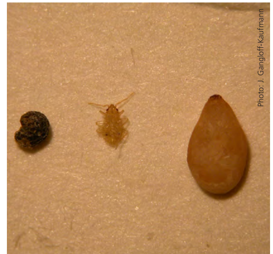
Newly hatched bed bug compared with a poppy and sesame seed.